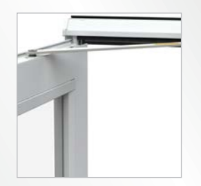
See what's hidden. Sleek built-in hidden closer with Click&Hold<sup>™</sup> keeps the door open.

Multi-point locking system secures door in three places for extra protection.